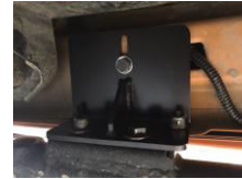
Front and rear brackets