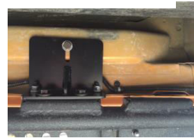
Center Bracket shown with reverse passenger side spacer bracket