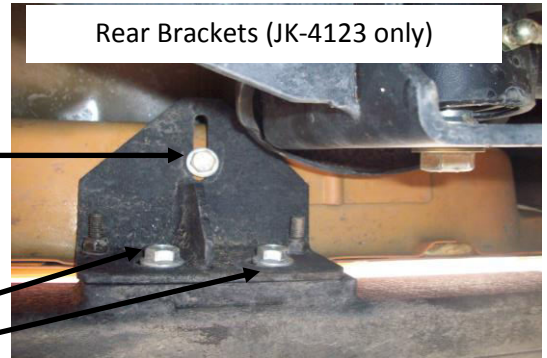
Rear Brackets (JK-4123 only)