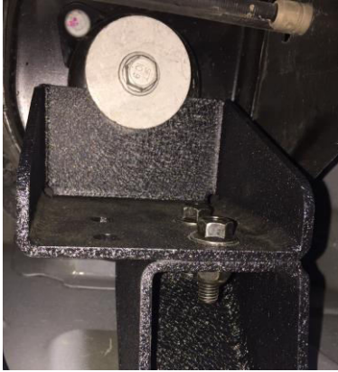
Rear Bracket Upper driver side