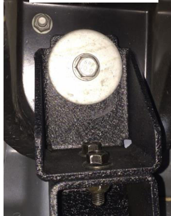
Center bracket upper